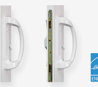
Single & Dual Mortise Handle

ENERGY STAR<sup>®</sup> Partner - In the average home, at least 40 percent of energy costs annually are spent on heating and cooling. Proper selection of windows and doors can significantly affect how much money it takes to keep our homes bright and comfortable. Look for the Energy Star partner label on all Cascade windows and doors.