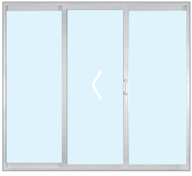
Cascade 3 Panel 9730 OX/O Door. 7-6 X 6-8 to 12-0 X 8-0.