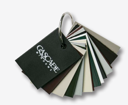
Optional exterior paint colors available for your next window and door project.

Whether it's new construction or a remodeling project, full frame or narrow frame that you need, we give you the flexibility to choose – at no additional cost – when you utilize our standard nail fin option. Standard and optional painted exterior windows are available in any series. Each series also includes your choice of positive auto-lock or traditional cam-lock.